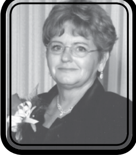
By Pam Potthoff Nebraska