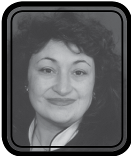
By Klodette Stroh Wyoming