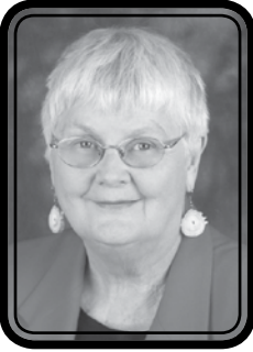
Montana